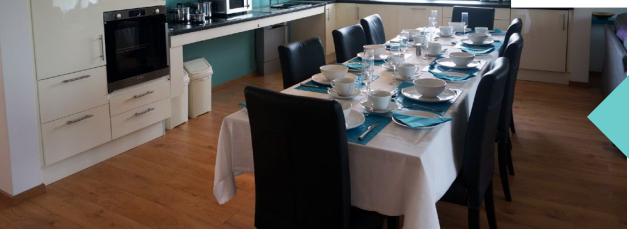
Dining & Kitchen