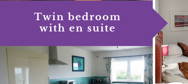
Twin bedroom with en suite