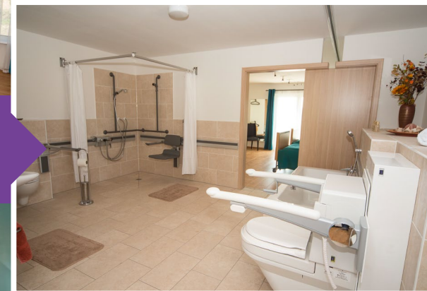
Double bedroom with ceiling hoist