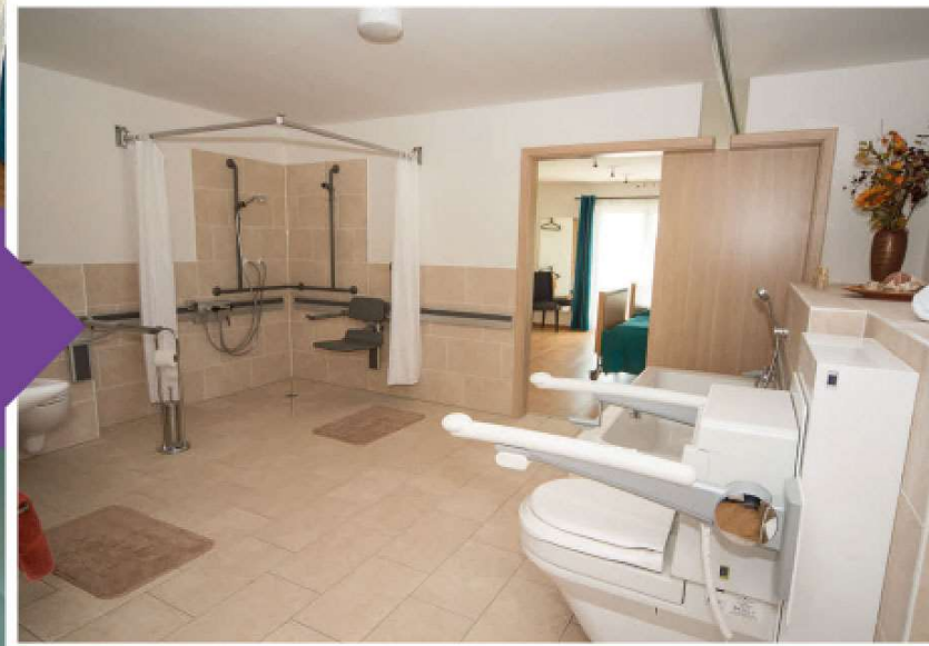
Wet Room with ceiling hoist