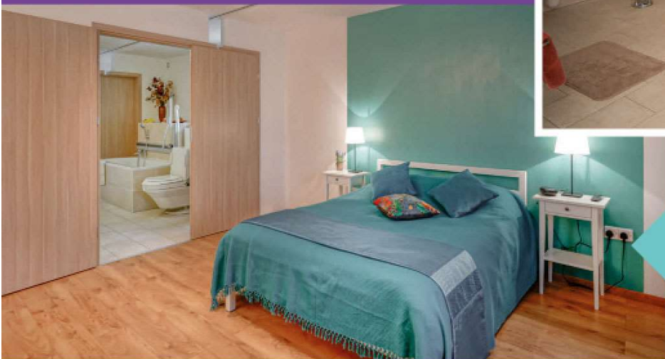
Double bedroom with ceiling hoist

To find out more about FLAT SPACES, and MAKE A BOOKING at our Ropley, Hampshire property, visit WWW.FLATSPACES.CO.UK & watch our virtual walk through