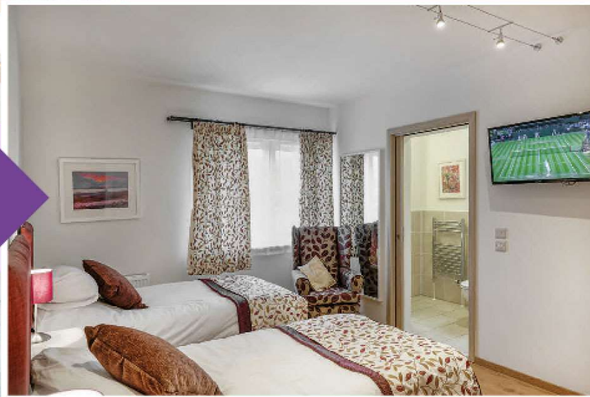
Twin bedroom with en suite